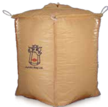
ROPE LIFTING BAG

Jumbo bag Ltd is one of the few companies in the world which is capable of producing Type D FIBC based on standard IEC 61340 in house from raw material stage to final bag.