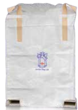
PALLET FREE BAG